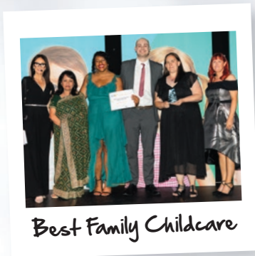
Best Family Childcare