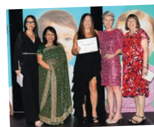
Charnwood Nursery and Preschool

At Citation, we're all about making your nursery the best it can be. By supporting you with every aspect of HR and Health & Safety, we give you the time to do what you do best – educate your children.