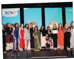
esSENTial Early Years

Judges felt that The Nursery in Belong demonstrated such a strong commitment to both team development and well-being, fostering a supportive environment that empowers staff to grow and thrive. They actively collaborate with wider communities, sharing expertise to strengthen the broader community. Their commitment to intergenerational care and experiences is phenomenal and their use of specialised programmes and collaboration with universities for research further underscores their dedication to advancing best practices and staying at the forefront of educational innovation.