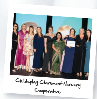
Childsplay Claremont Nursery Cooperative

Other finalists: Gryffe Manor Nursery and Haddo Woodland Kindergarten.