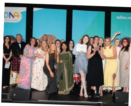
The Nursery in Belong

Here are the NDNA Nursery Awards 2025 winners!