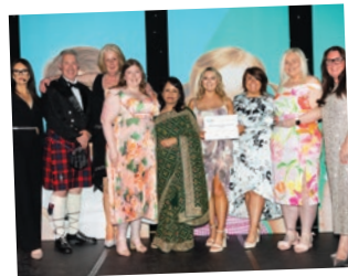
Great Western Early Years - Kingswells