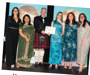
Kensington International Kindergarten

Other national finalist: Banana Moon Bridge of Don.