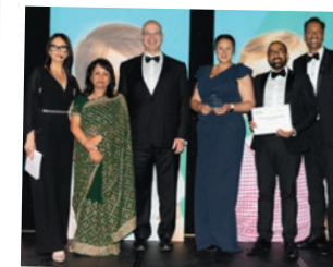
Little Lodge Nursery