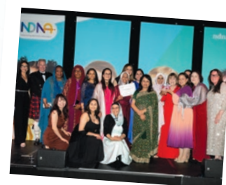
Bumble Bees Day Nursery